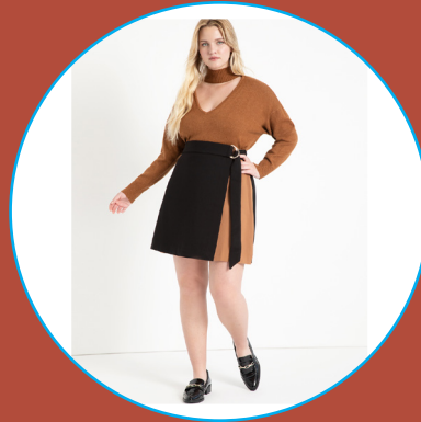
Colorblocked Skirt with Belt ELOQUII eloquii.com $74.95

A belted dress is easy to throw on but always looks good—especially when it has a cool colorblocked print. Knee-high boots complete the ensemble, or if you want to keep it casual, sandals or flats will work too.