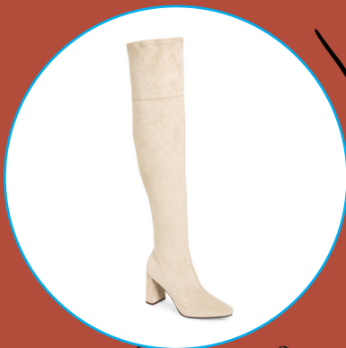
Parisah Over the Knee Boot JEFFREY CAMPBELL nordstrom.com $204.95

Need a go-to winning outfit combo? Style all of your mini dresses with a pair of over-the-knee boots.