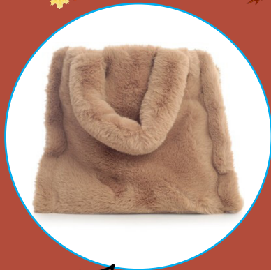
Lolita faux fur tote STAND STUDIO net-a-porter.com $75.00

Whether you're going to work or just need a new tote, everything from your computer to your lunch will fit in here.