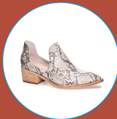
Fortune Bootie CHINESE LAUNDRY Nordstrom $100.00

For all my folks who don't like leather shoes rubbing their ankles, this low-rider pair is exactly what you need.