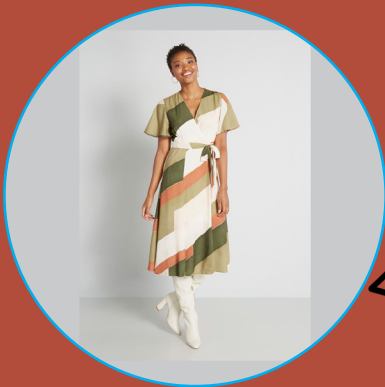
These Days Are Ours Midi Dress HUTCH modcloth.com $149.00

A belted dress is easy to throw on but always looks good—especially when it has a cool colorblocked print. Knee-high boots complete the ensemble, or if you want to keep it casual, sandals or flats will work too.